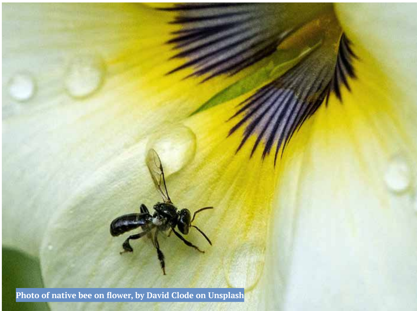
Photo of native bee on flower